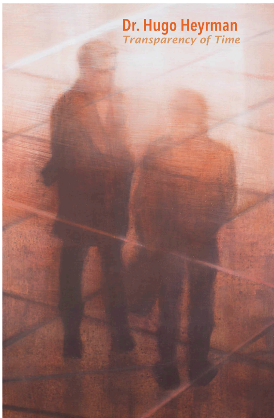
Transparent Interaction, 2016